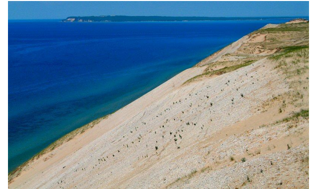
Sleeping Bear Bluffs

Each year we have an Annual Trek to an area of great natural beauty. In 2010 we are planning to meet in the Grand Traverse area of Michigan. This is the home of the Cherry Festival, Sleeping Bear Dunes, several lighthouses, islands to visit and more. Our Trek in 2009 was to the Maine seacoast.